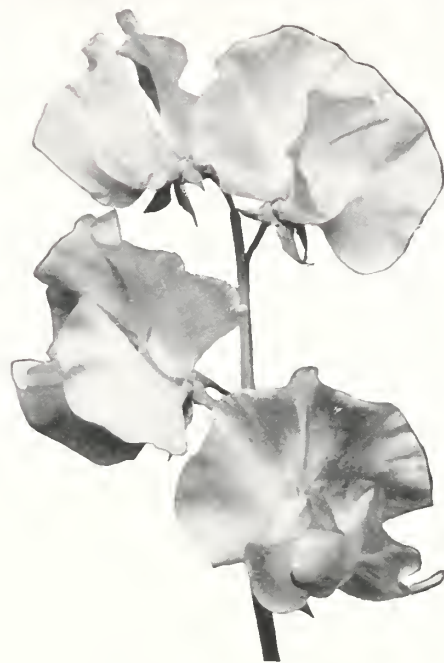
MORSE'S GIANT ROSE 1-3 Natural Size

WHITE HARMONY —A strong growing, black seeded pure white. Being black seeded it germinates easily. It is a pure solid white. The stems are long, flowers large and of exquisite form. Price: 1 oz. 65c; 4 ozs. $2; 8 ozs. $4; lb. $8.50.